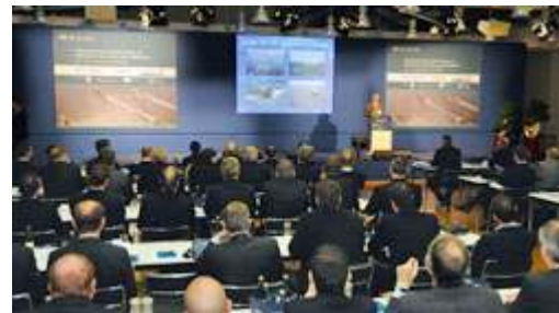
About 200 participants listened to the high-calibre speakers, exchanged ideas, and enjoyed an attractive supporting programme.

Top marks for the first International Maritime Security & Defence Conference (MS&D 2008)! It was held concurrently with the world's leading shipbuilding fair SMM in Hamburg, with participation of some 200 delegates from 20 nations, and numerous high-ranking representatives of navies from various parts of the world. This two-day conference was arranged by Hamburg Messe & Congress GmbH and the Bonn-based publishing house Mönch Verlag, represented by Naval Forces. It addressed the most pressing problems of shipping – piracy and terrorist threats. There were outstanding international speakers, specifically targeting the political, maritime strategy and industrial aspects. The conference not only identified and analysed problems, but also offered concrete solutions – a unique combination, which makes MS&D stand out from other security conferences.