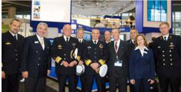
High ranking representatives of the German and Netherlands Navy visiting MS&D 2008

Experts from navies, coastguards, industry and government are very keen on MS&D and its establishment as an international platform for maritime security and defence in Germany. 93% of the 2008 participants are already planning to attend MS&D 2009.