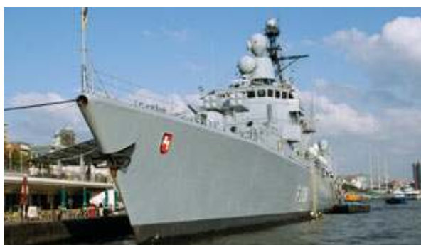
Advanced weapon systems will be on show on frigates in the Port of Hamburg.

Key issues at the future exhibition, presenting products and technologies for effective defence against armed attacks, will be electronic surveillance systems, communication and information systems, software systems, ship security equipment, weapons and weapon systems, research & development, and security consulting. The international conference will include leading speakers, who will analyse the threat situations, put forward solution proposals, and present current developments. International delegations at the trade fair of MS&D 2009 will have a chance to collect information, exchange ideas, and view the most advanced weapon systems in practice on naval vessels in the Port of Hamburg.