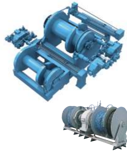
Mooring winches and towing winches Anchor windlasses and capstans Towed array sonar winches Deep-sea scientific winches Electric, frequency controlled anchoring and mooring systems

A comprehensive range of high/low pressure hydraulic and electric mooring and anchoring systems are offered for virtually all commercial and naval requirements. Products and systems are from the Rolls-Royce and Rauma Brattvaag™ product ranges.