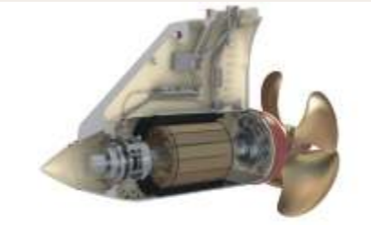
Available from 5-25MW

With the recent move to electric propulsion the Mermaid™ pod propulsion system, developed by Rolls-Royce AB and Alstom is now in service in a variety of applications. The unit acts as a propulsor and rudder, with an integrated electric motor located within the hydrodynamically optimised housing driving the shaft.