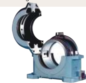
Propeller shaft bearings and Thrust blocks Thrust metering and resonance changing equipment Bulkhead sealing glands Gearbox thrust and journal bearings

Acknowledged as the world's foremost supplier of self-contained white-metal faced bearings, our compact and robust Michell Bearings product range is suitable for all vessel types.