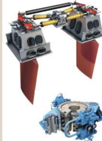
Actuator Type: Torque 3.7 - 45.7TM Rotary Vane: Torque 2 - 256TM Ram Type: Torque 50.2 - 1708TM

Rolls-Royce have long been leaders in the supply of steering gear and rudders for both naval and commercial vessels. All products are from the proven Brown Brothers, Tenfjord and Frydenbø ranges.