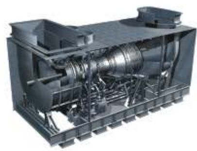
AG9140 (3MW) Spey (19.5MW) WR-21 (25MW) MT30 (36MW)

As the pioneer of aero-derivative gas turbines for surface ship propulsion, Rolls-Royce offers turbines in the 3 - 50MW power range. The Allison AG9140 gas turbine generator set powers all US Navy DDG-51 destroyers. The world's most advanced marine gas turbine, the WR-21 will power the Royal Navy's Type 45 destroyer. The MT30 has been selected to power the engineering development model for the US navy's DD(X) future surface combatant and has been nominated to power the UK's Future carrier.