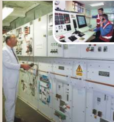
Design and systems integration HV/LV electrical distribution and power management Platform and vessel management VTAS Automation and Control

With the recent acquisition of VT Controls, Rolls-Royce has added an extensive capability in electrical power, propulsion, control and automation. The acquisition complements the Rolls-Royce established data management, bridge automation, monitoring, control and dynamic positioning capability. Over 550 systems are in naval service.