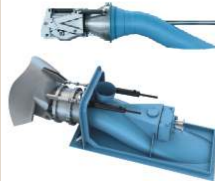
FF series: 40kW - 1,500kW A series: 500kW - 2,900kW SII series: 500kW - 50MW

Rolls-Royce is the world's leading expert in waterjet technology. Our Kamewa range of waterjets is the broadest in the business and have been installed in 20 different classes of naval vessel. Three waterjet 'families' are available for a variety of applications manufactured in aluminum and stainless steel. Rolls-Royce is also developing and testing the underwater discharge AWJ-21™ for future naval vessels requiring reduced signatures and improved manoeuvrability.