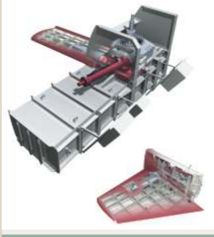
Modular non-retractable fin area 0.85m 2 - 16.5m 2 Gemini non-retractable fin area 1.4m 2 - 3.2m 2 Aquarius folding fin area 1.82m 2 - 7.48m 2 Neptune folding fin area 3.8m 2 - 22.5m 2 Passive tank stabilizer and rudder roll systems

Our expertise in fin stabilization and passive controlled tank stabilization from the well known Brown Brothers and Inering product ranges, enables Rolls-Royce to offer combined systems for improved motion control. The broad product range suits all ship sizes with naval and commercial versions.