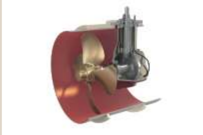
11 Sizes:- power to 3,700kW

The new TT series Kamewa Ulstein tunnel thrusters come in 11 sizes, for powers up to 3,700kW. All are available with different hydrostatic heads catering for either deep or shallow draft vessels and using CP or FP propellers. For ice class, stainless steel propellers and Kaplan-type blades are used.