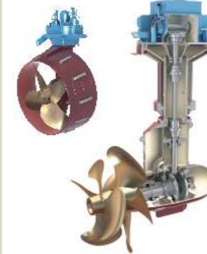
Seven designs: 330kW - 5,500kW

Modularized Azimuth thrusters in the Ulstein Aquamaster range are available in a variety of standard and retractable designs, with the options of open or ducted CP and FP propellers. For special applications the CRP (contra-rotating propeller) unit offers high efficiency (10-15% improvement) with low noise and vibration and the new Azipull pulling propeller is ideal for higher speed vessels.