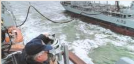
Dual capacity high performance jackstay rig Crane rig Large derrick rig Astern refueling rig Latched back derrick rig Movable high point

With many modern navies moving to the low-manned all-electric ship concept, we have developed automatic transfer replenishment gear to complement our range of conventional abeam and astern systems for liquids and solids transfer.