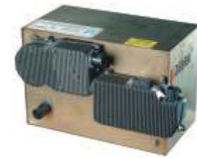
Battery modules 12-600 volts and 2-50kWh

The Sodium/nickel chloride Zebra battery is a versatile power source for a wide range of future applications. Offering high energy density and lightweight with zero maintenance characteristics, modules are half the volume and about 40% of the weight of the lead-acid equivalent and can make up batteries of virtually any size and specification.