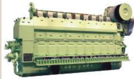
Bergen B32-40 (2.9MW - 6.0MW) Bergen K series (0.9MW - 4MW) Bergen C25-33L (1.1MW - 2.7MW) Bergen B (2.6MW - 5.3MW) Crossley Pielstick PA6 STC (4.2MW - 5.7MW) Crossley Pielstick PA6B STC (5.3MW - 8.9MW) Crossley Pielstick PC2.6 (6.6MW - 9.9MW) Crossley Pielstick PC2.6B (9MW - 15MW)

Four Bergen diesel engine families provide powers from 0.9MW-6MW and deliver reliable power as prime movers or as packaged generator sets. Rolls-Royce also manufactures under license the well known Crossley Pielstick engine range for powers of 3.8MW - 15MW.