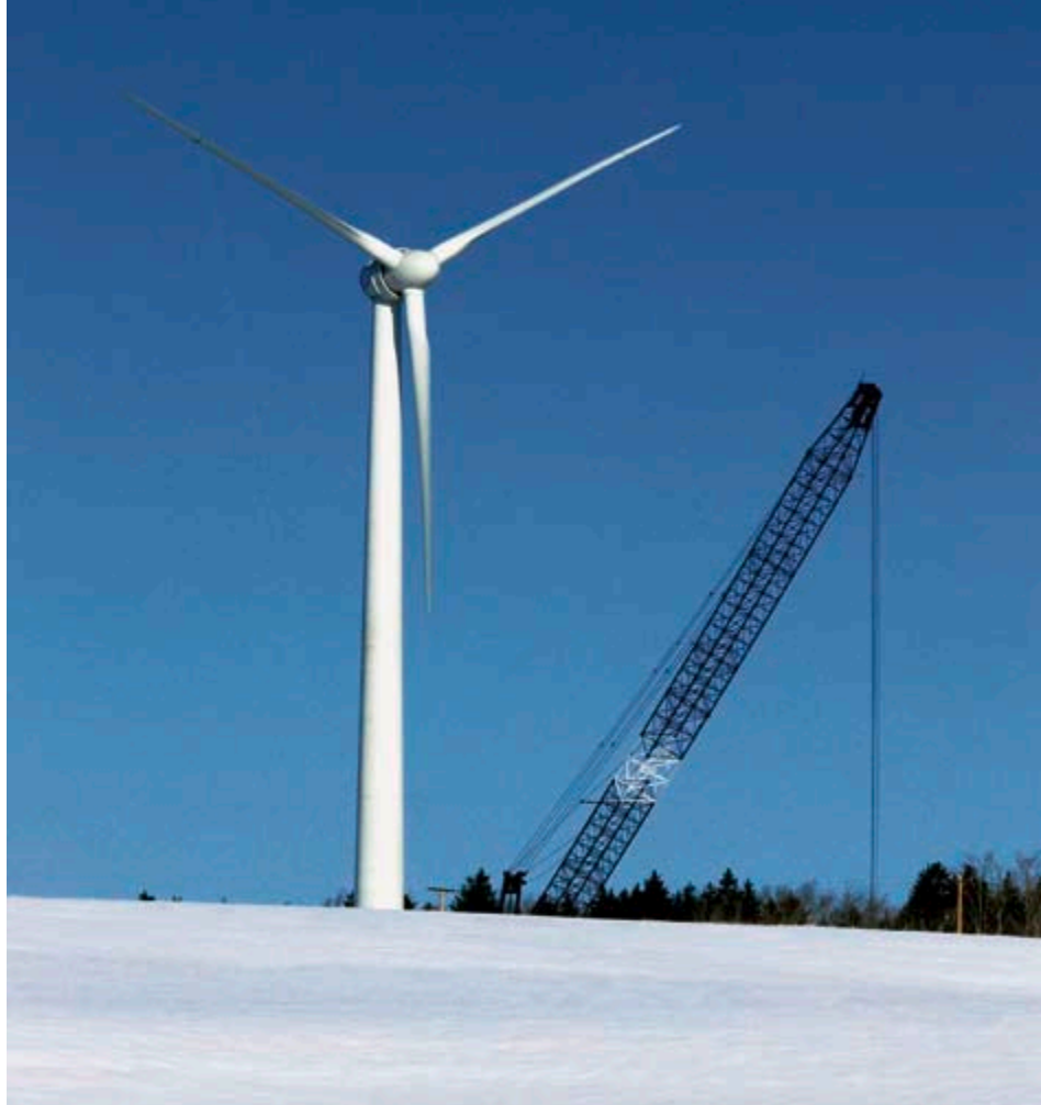
Many wind energy plants in Canada – such as this one in Springhill, Nova Scotia – operate under arctic conditions.

The course has been set. It is not only individual states promoting wind energy by setting quotas, but also Washington. In early